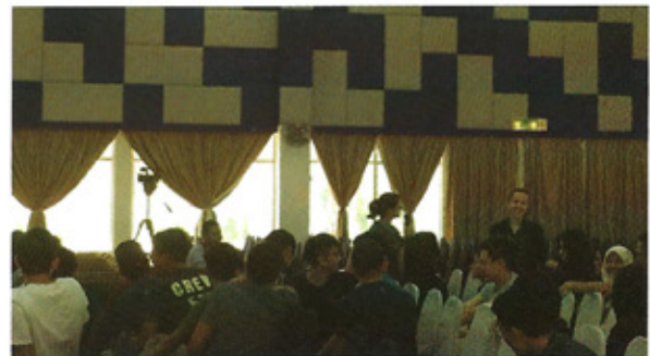
SEARCCT sharing a light moment with students during the University Lecture Series programme at KYUEM, 28 June 2018