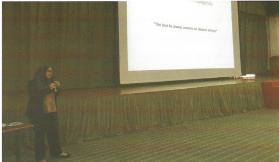
SEARCCT giving a Terrorism Awareness lecture during the University Lecture Series programme at Kolej Yayasan UEM (KYUEM), 28 June 2018