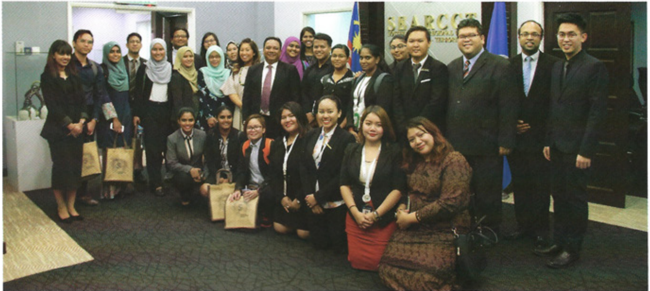
Visit by UniRazak students to SEARCCT, 25 April 2018