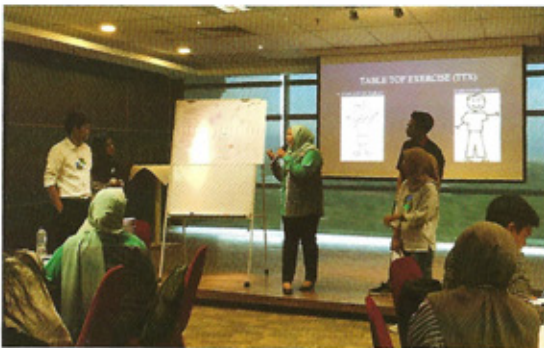
Participants giving a presentation during the Targeting and Preventing Extremism for Youths (TAPESTRY) programme, 24- 25 October 2018