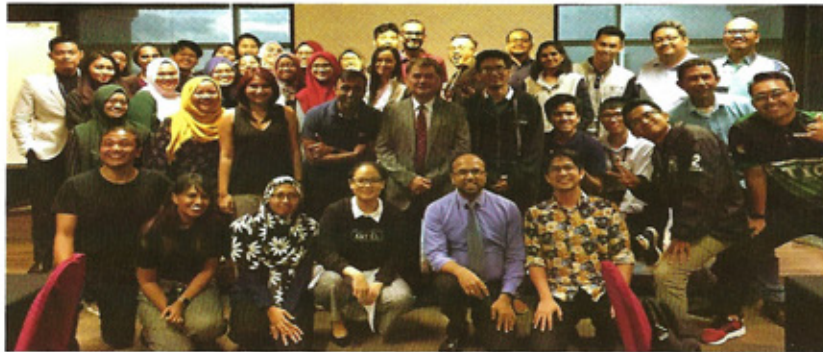
SEARCCT officers with participants during the Targeting and Preventing Extremism for Youths (TAPESTRY) programme, 24- 25 October 2018