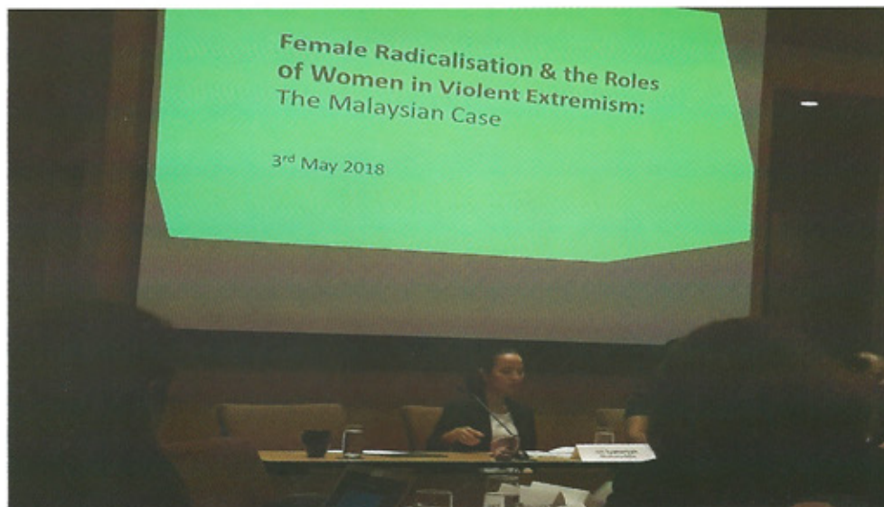
SEARCCT presenting on "Female Radicalisation and the Roles of Women in Terrorist Organisations: The Malaysian Case" at the Workshop on P/CVE in Southeast Asia: Advancing Gender Inclusion and Women's Participation, 3 May 2018