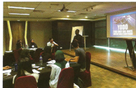
SEARCCT giving a presentation during the Targeting and Preventing Extremism for Youths (TAPESTRY) programme, 24-25 October 2018