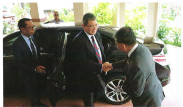
Visit by the Foreign Minister YB Dato' Saifuddin Abdullah to SEARCCT, 25 July 2018