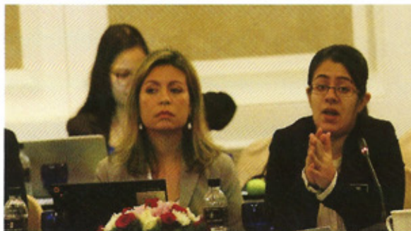
SEARCCT giving a presentation on “Terrorist Use of ICT and Violent Extremism in the Region” at the 3rd Asia ICT and CT Dialogue in Kuala Lumpur, 7 November 2018.