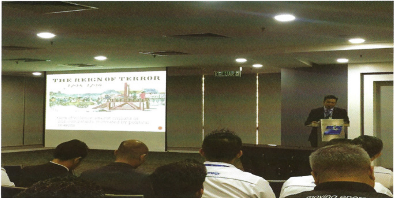
SEARCCT giving a presentation on “Global Threats and Trends of Terrorism” at the Terrorism Awareness Programme, hosted by the Malaysian International Shipping Cooperation (MISC) Bhd. in Kuala Lumpur, 9 February 2018.