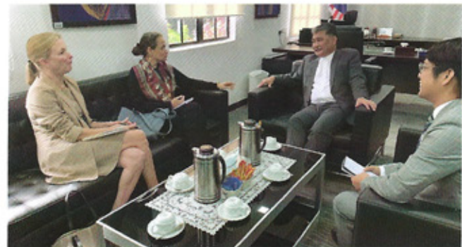
Courtesy call by H.E Kamala Shirin Lakhdir, Ambassador of the U.S. to Malaysia, on the DG of SEARCCT, 21 December 2018