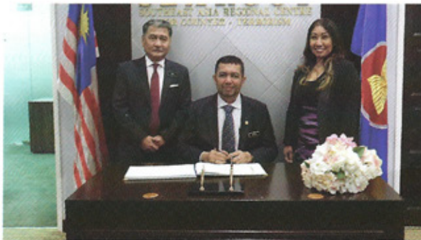
Visit by the Deputy Foreign Minister, YB Dato' Marzuki Yahya to SEARCCT, 7 August 2018