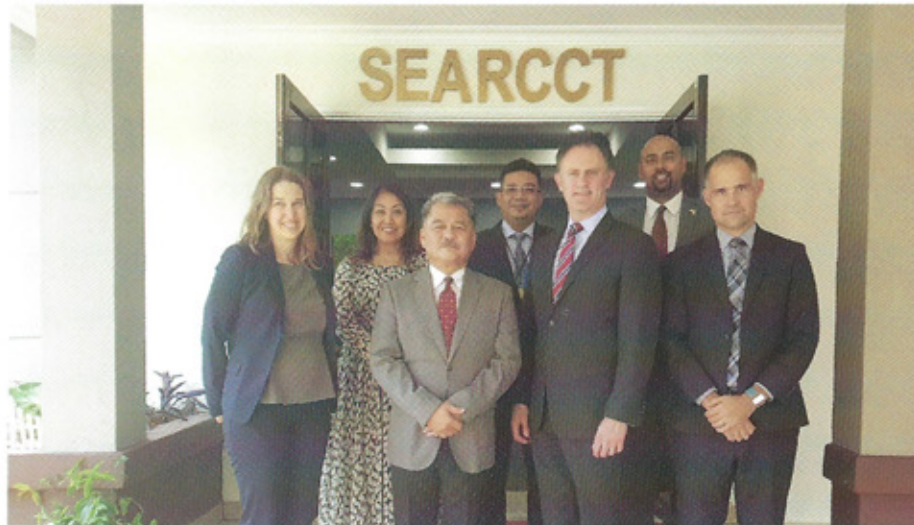
Visit by H.E. Ambassador Nathan Sales, Coordinator for Counterterrorism U.S. Department of State to SEARCCT, 13 September 2018