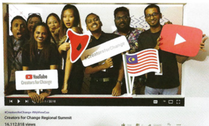
SEARCCT at the YouTube Creators for Change Regional Summit, 16 November 2018