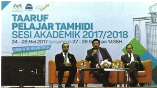
SEARCHCT'S UNIVERSITY LECTURE SERIES (ULS) AT INSTITUT KEMAHIRAN MARA (IKM) KUALA LUMPUR ON 2 AUGUST 2017.