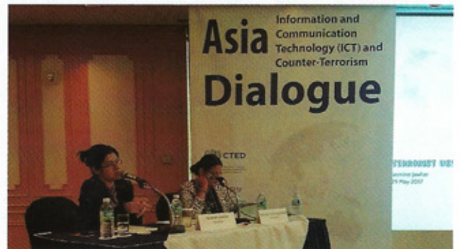
SEARCHCT PRESENTING AT THE ASIA DIALOGUE ON INFORMATION AND COMMUNICATION TECHNOLOGY (ICT) AND COUNTER TERRORISM ON 29 MAY 2017 IN JEJU ISLAND, SOUTH KOREA.