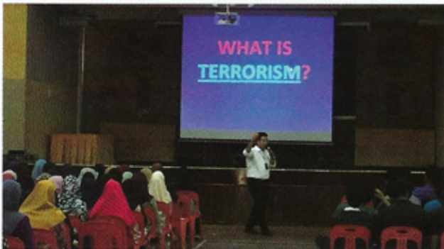
SEARCHCT'S UNIVERSITY LECTURE SERIES (ULS) AT KOLEJ PROFESIONAL MARA, BERANANG, SELANGOR ON 6 APRIL 2017.