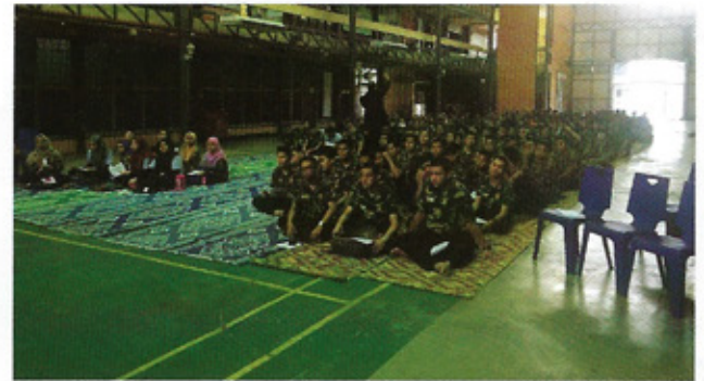
SEARCHCT'S UNIVERSITY LECTURE SERIES (ULS) AT INSTITUT KEMAHIRAN MARA (IKM) KUALA LUMPUR ON 2 AUGUST 2017.