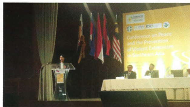
SEARCHCT PRESENTING AT THE CONFERENCE ON PEACE AND THE PREVENTION OF VIOLENT EXTREMISM IN SOUTHEAST ASIA ON 23 SEPTEMBER 2017 IN MANILA, THE PHILIPPINES.