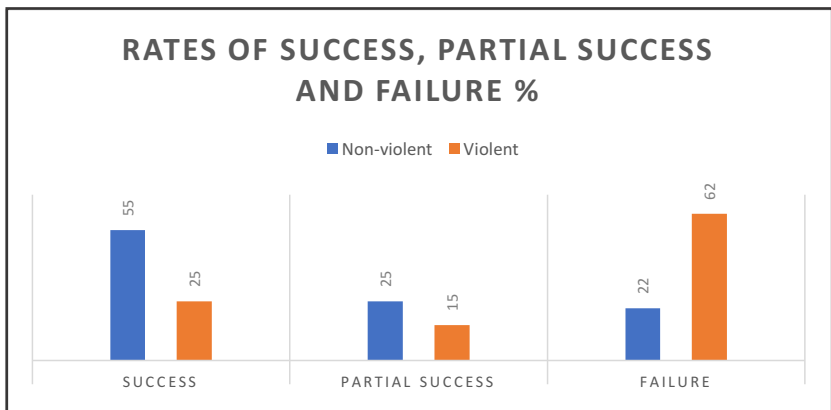
Figure showing rates of success, partial success and failure of both non-violent and violent campaign.

Stephan developed the Nonviolent and Violent Campaign and Outcomes (NAVCO) data sets in which they analysed 323 violent and non-violent resistance campaigns between 1900 and 2006. 153 According to them, “the most striking finding is that between 1900 and 2006, non-violent resistance campaigns were nearly twice as likely to achieve full or partial success as their violent counterparts”. 154 This means that the non-violent campaigns that took place between the years of 1900 and 2006 had double the chance of success when compared to the violent campaigns during that similar period.