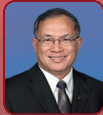
The Honourable Datuk Richard Riot anak Jaem Deputy Minister of Foreign Affairs