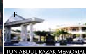
TUN ABDUL RAZAK MEMORIAL