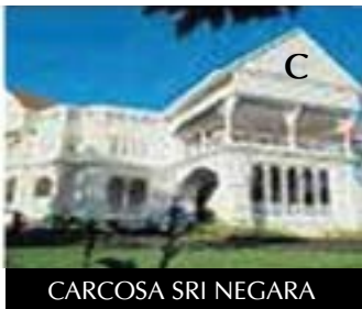
CARCOSA SRI NEGARA