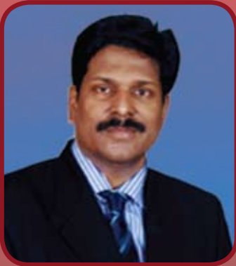
The Honourable Senator A. Kohilan Pillay, Deputy Minister of Foreign Affairs