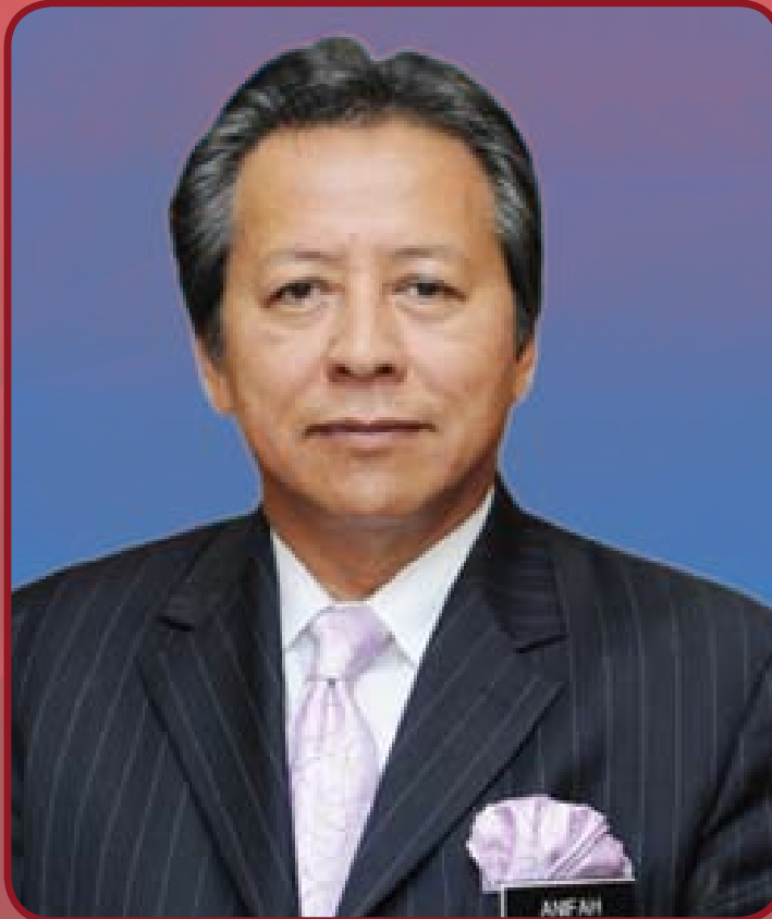
The Honourable Dato' Sri Anifah bin Haji Aman, Minister of Foreign Affairs, Malaysia